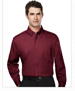
810 EXECUTIVE 6 OZ. 100% COTTON TWILL SHIRT AS LOW AS $23.50(P)*