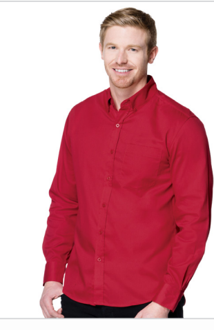
W700LS REGAL LS 3.8 OZ. 60/40 BRUSHED TWILL SHIRT AS LOW AS $22.00(P)*