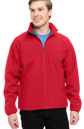
J6350 VITAL SOFTSHELL WINDPROOF WATER-RESIS-TANT MICROFLEECE LINER