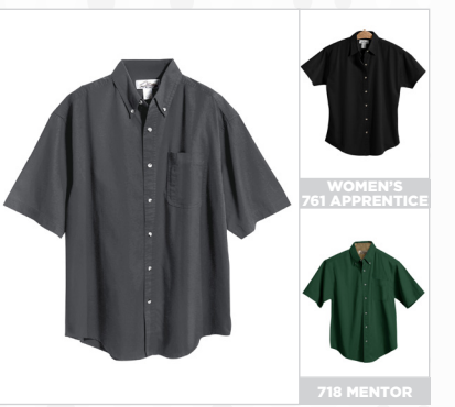
768 RECRUIT 5.5 OZ. 60/40 STAIN RESISTANT TWILL SHIRT AS LOW AS $25.00(P)*