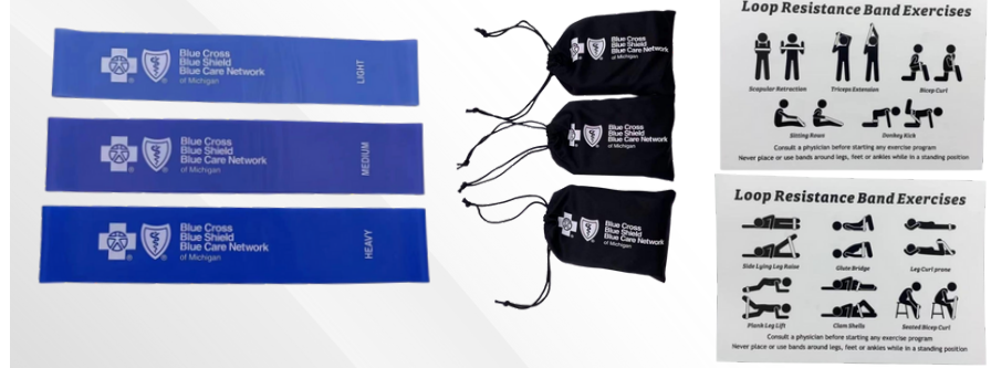
Health Care – BCBS Resistance band with legible card