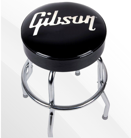
Entertainment – Gibson Bar stools