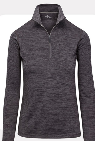
Ladies HEATHER CHARCOAL