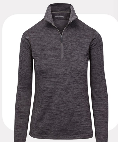
Ladies HEATHER CHARCOAL