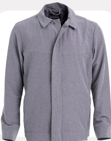
Men's HEATHER GREY

This city inspired jacket with fold down collar has a clean and simple silhouette with thoughtful design details to stand it apart from the crowd. Featuring slick aesthetics and stretchy Elasti-Shell™ for all day comfort, this jacket has you covered from the conference room to the happy hour taproom, and everything else in between.