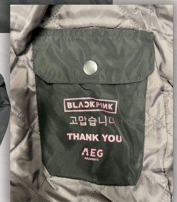
Screen Print Inside Pocket