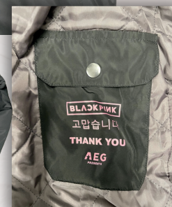
Screen Print Inside Pocket