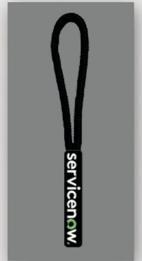
Custom Zipper Pull