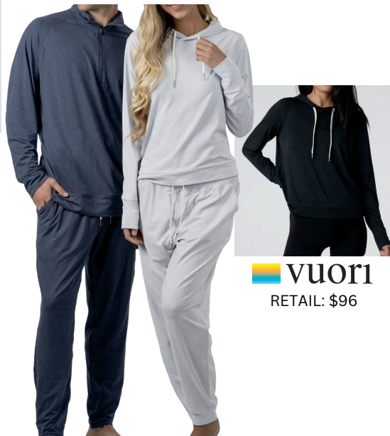
VUORI RETAIL: $96